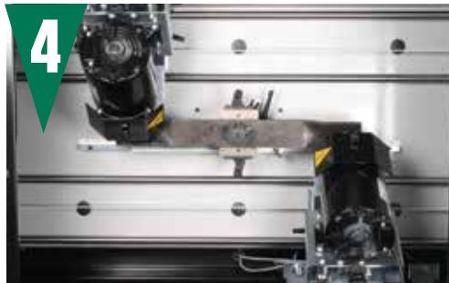
DUAL GRINDING HEAD