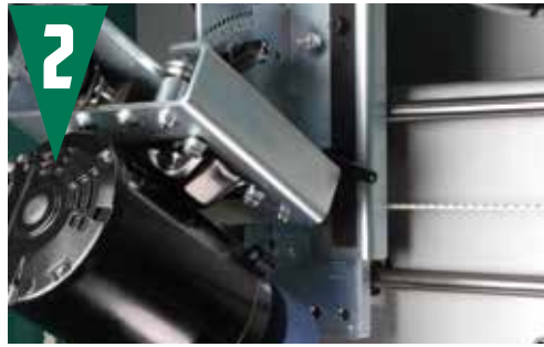
HEIGHT ADJUSTMENT & ANGLE ADJUSTMENT