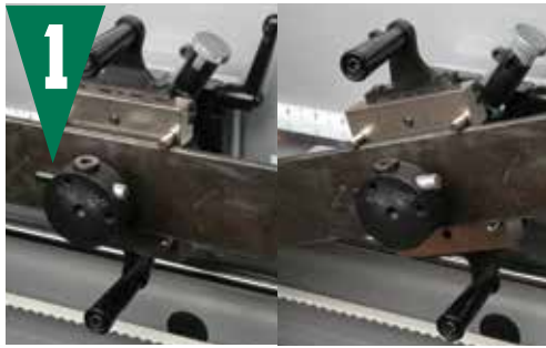
BLADE BALANCING SYSTEM