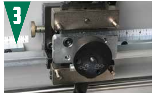
CENTER HOLE - QUICK CONNECT CONE