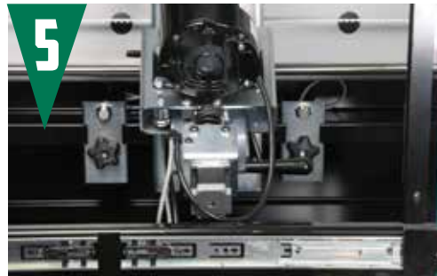
TRAVEL LIMIT PROXIMITY SWITCH